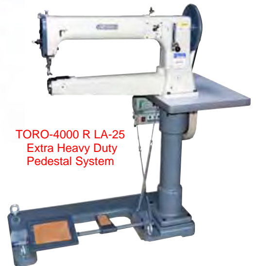
TORO-4000 R LA-25 Extra Heavy Duty Pedestal System