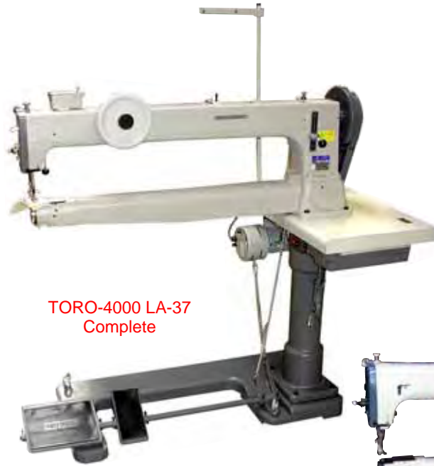
TORO-4000 LA-37 Complete