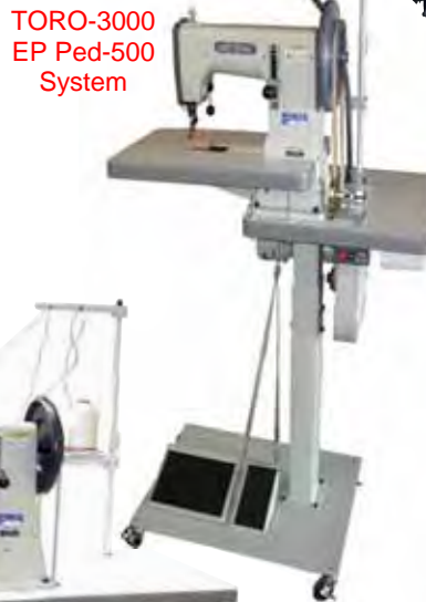
TORO-3000 EP Ped-500 System