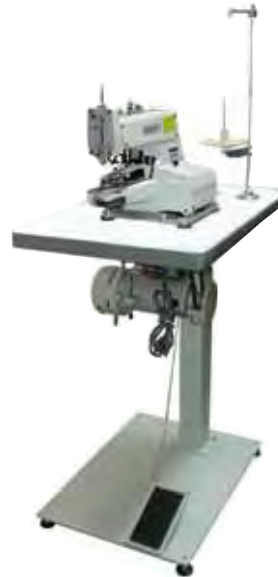
B-373-NS Button Sewer