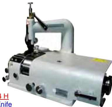
NP-4 H Bell Knife Skiver