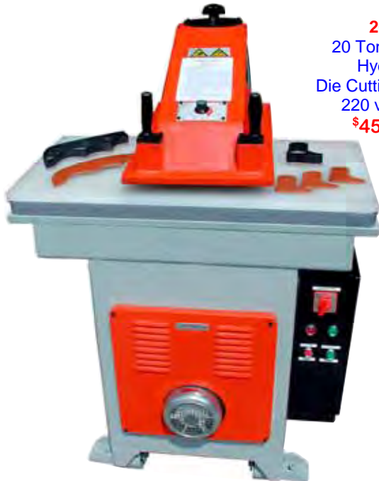
200-B 20 Ton "Clicker" Hydraulic Die Cutting Machine 220 volt 1 ph. $4550.00