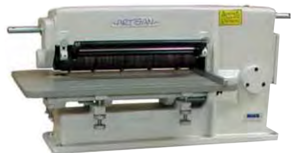
AK-20 14" wide Belt and Strip Cutter