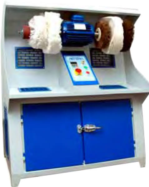
1000 H Buffing and Finishing Machine with a Vacuum Waste Disposal System and a Variable Speed Motor Controller 220 volt 1 Ph. $1950.00