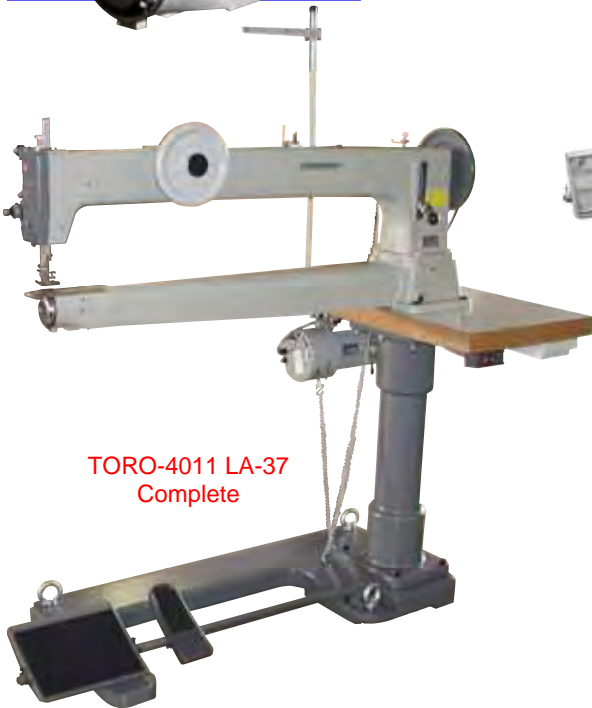
TORO-4011 LA-37 Complete