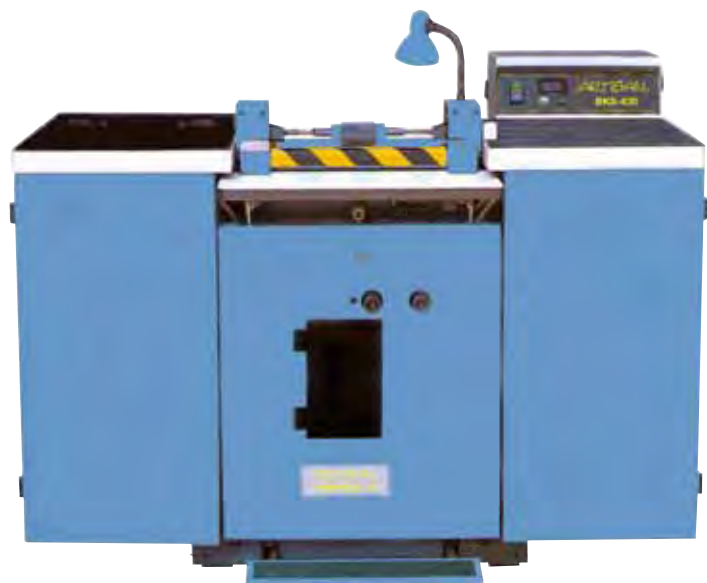
BKS-420 16" Automatic Band Knife Splitter with Dust Collector. Max split thickness 8 mm or 5/16" Min Split 1/32" Feed Rate up to 30 feet per minute.