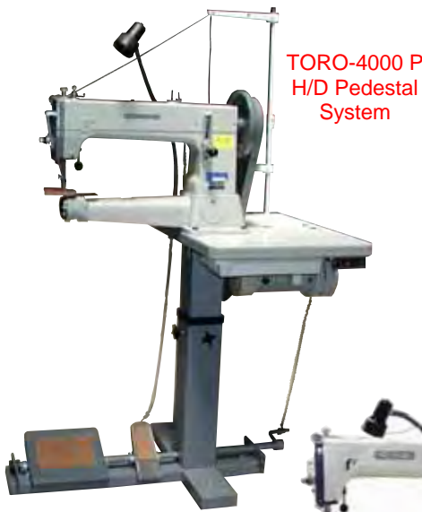
TORO-4000 P H/D Pedestal System