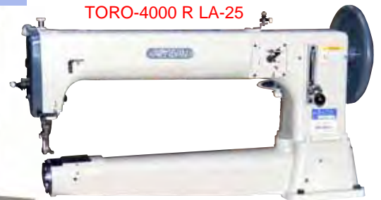
TORO-4000 R LA-25