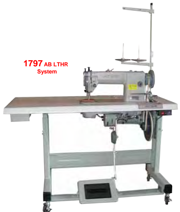
1797 AB LTHR System