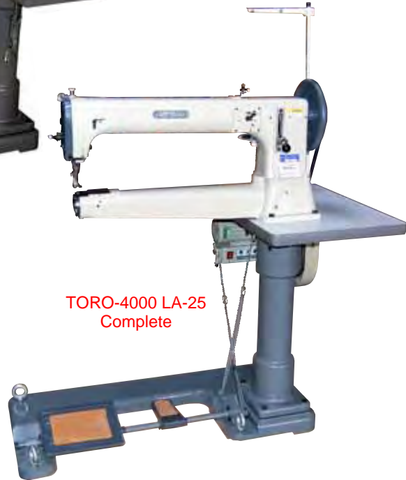
TORO-4000 LA-25 Complete