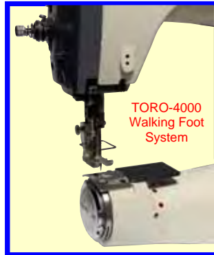
TORO-4000 Walking Foot System