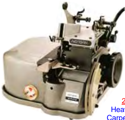
2502 Heavy Duty Carpet Serger