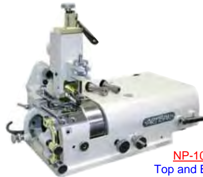
NP-10 H Top and Bottom Feed Skiver