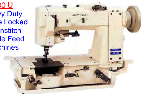
300 U Heavy Duty Double Locked Chainstitch Needle Feed Machines