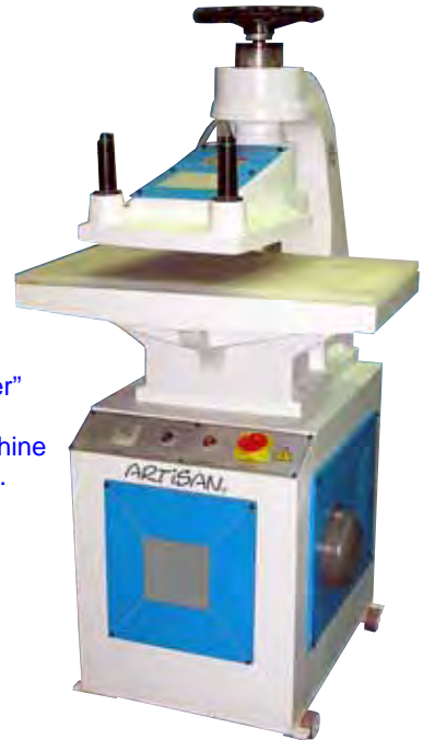
100-B 10 Ton "Clicker" Hydraulic Die Cutting Machine 220 volt 1 ph. $2950.00