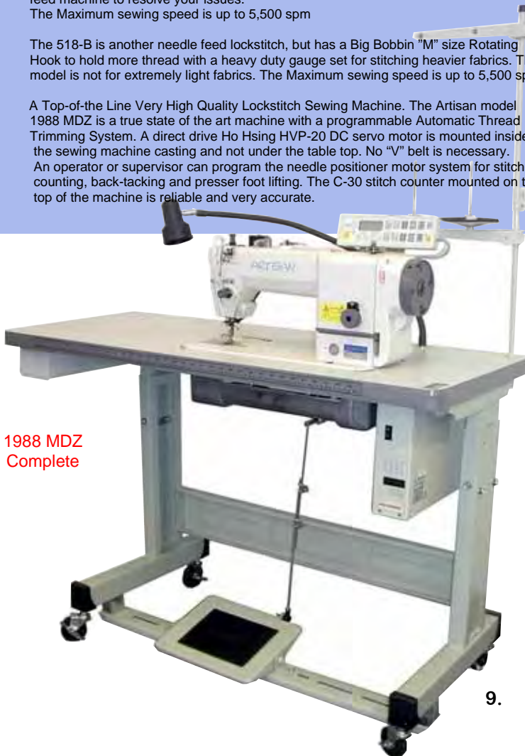
1988 MDZ Complete