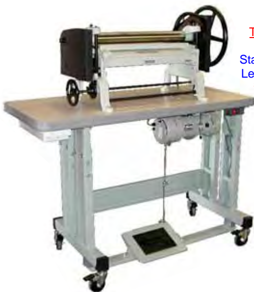
TORO-1020 20 " Stationary Knife Leather Splitter $1995.00