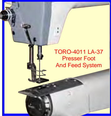
TORO-4011 LA-37 Presser Foot And Feed System