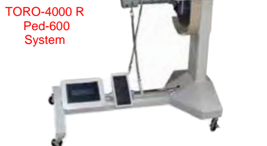
TORO-4000 R Ped-600 System