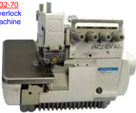
732-70 Overlock Machine