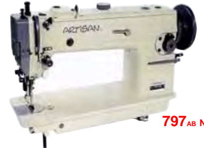
797 AB NS